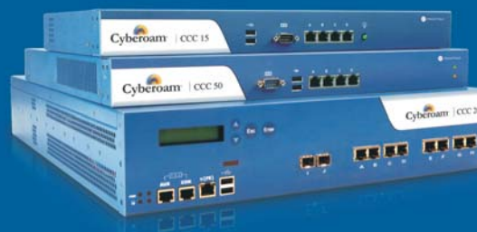
CCC Series : CCC15, CCC50, CCC100, CCC200

Cyberoam's Web GUI enables remote management of all distributed Cyberoam security devices including policy management, compliance enforcement, monitoring and control.